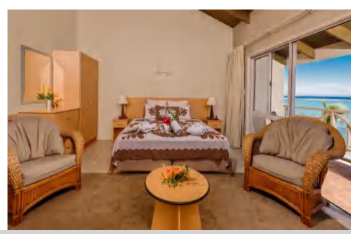
DELUXE BEACHFRONT STUDIO