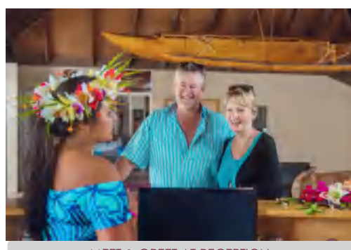
MEET & GREET AT RECEPTION