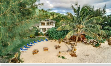
AROA BEACHSIDE RESORT

The Shipwreck Hut is an authentic beach bar situated onsite and is a great place to enjoy a light meal and a cold beverage on the beach. Enjoy an evening on the sand with live entertainment offered three times a week and superb sunset views.