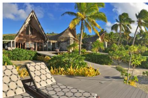
VIEW TO VILLAS FROM THE BEACH