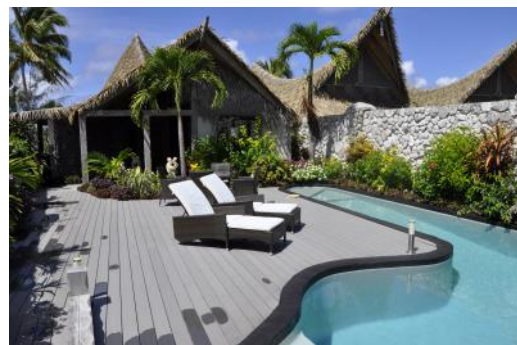
PRIVATE COURTYARD & SWIMMING POOL

Aitutaki Escape was designed with guests maximum comfort in mind and providing a haven detached from the busy resorts and their holiday makers. Air-conditioned with high ceilings, these spacious villas come fully equipped with all the modern amenities needed, plus many added bonuses to ensure guests stay is a relaxing as possible.