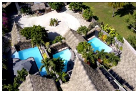
AERIAL VIEW OF AITUTAKI ESCAPE

Aitutaki Escape is undoubtedly a peaceful and secluded haven of absolute tranquility and ultimate relaxation.