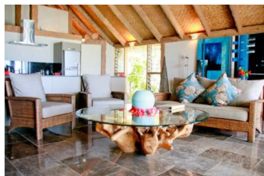
ONE BEDROOM LOUNGE AND KITCHEN

Complimentary personal VIP return airport transfers with flower 'ei' greeting on arrival & full villa orientation, daily island breakfast delivered to your villa each morning & welcome fruit basket on arrival, complimentary Wi-Fi onsite, free use of kayaks, in-room telescope for star gazing, complimentary access to hard drive in-house movie selection, and free supply of UV filtered drinking water. Complimentary concierge services provided during regular Aitutaki business hours (8.00AM - 12.00PM).