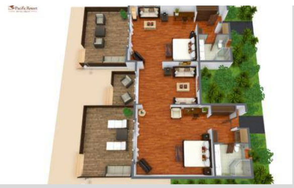
PREMIUM BEACHFRONT BUNGALOW 2 BEDROOM