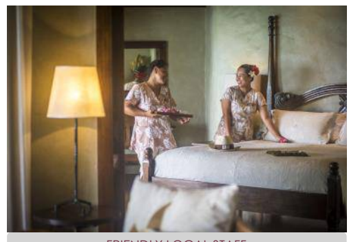
FRIENDLY LOCAL STAFF

Complimentary Return Airport Transfers, Ei Meet & Greet, Tropical Welcome Drink on Arrival, Daily Fully Cooked A-la Carte Breakfast served in Rapae Bay Restaurant, Complimentary Unlimited Wi-Fi, Complimentary use of Kayaks, Standup Paddle Boards, Beach Towels, Sun Loungers and Push-Bikes.