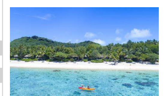
KAYAK IN PARADISE