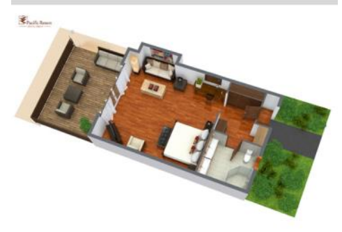
PREMIUM BEACHFRONT BUNGALOW