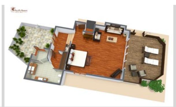
ULTIMATE BEACHFRONT BUNGALOW