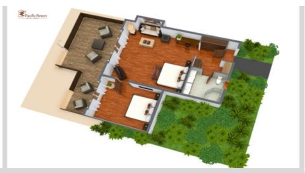
PREMIUM BEACHFRONT BUNGALOW PLUS