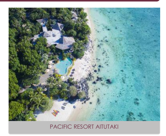
VIEW TO RAPAE BAY RESTAURANT & POOL

The Tiare Spa (day spa) offers guests a variety of services such as massages and beauty treatments for guests ultimate relaxation.