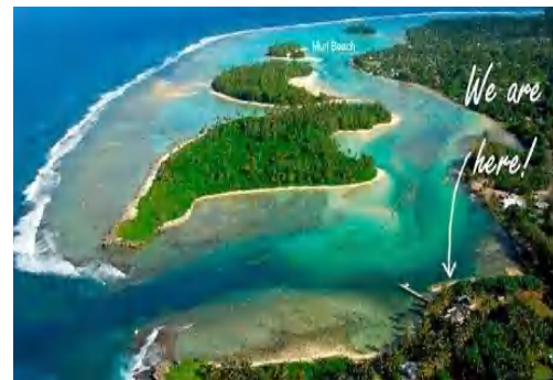
AVANA WATERFRONT BEACH LOCATION

A well appointed property in secluded location with stunning views.