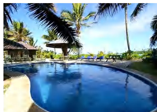
SWIMMING POOL & BBQ BEACH HUT