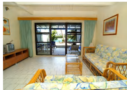
LOVELY LOUNGE AREA