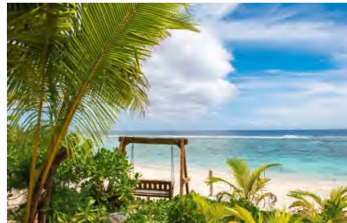
STRIKING BEACHFRONT VIEW

Onsite, you will find a stunning beach, a cool-off swimming pool, tour desk and complimentary snorkelling and kayaking gear. The Cooks Oasis also has easy access to many outside facilities including a small local bakery and a comprehensive range of casual and fine dining options.