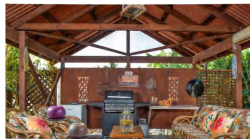
SHELTERED OUTDOOR BBQ AREA