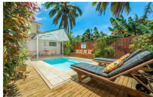
SWIMMING POOL & TROPICAL GARDEN SURROUNDING