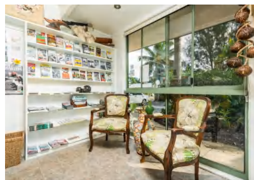
THE COOKS OASIS HOLIDAY VILLAS RECEPTION