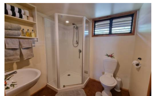
TOILET & SHOWER