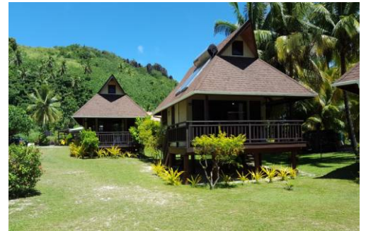
AITUTAKI BEACH VILLAS

With such easy access to everything you need, there is nothing you can go without here, the beach is within walking distance and the tropical atmosphere is at your embrace, Aitutaki Beach Villas is nothing more than the perfect place to be, your very own home away from home, in paradise.