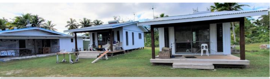
ONE BEDROOM VILLAS WHILE UNDER CONSTRUCTION — AWAITING NEW IMAGERY