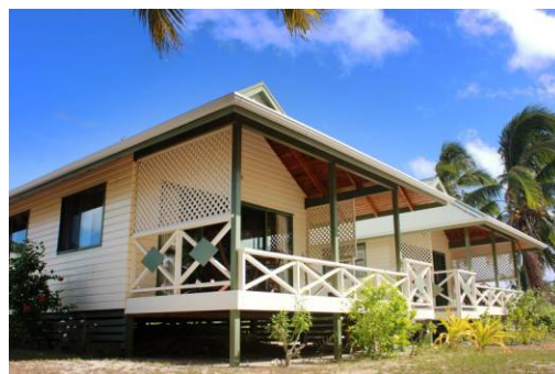
Paparei Bungalows awaits...

Room service is done twice weekly. Tours, rental cars or scooters can be arranged for you on request.