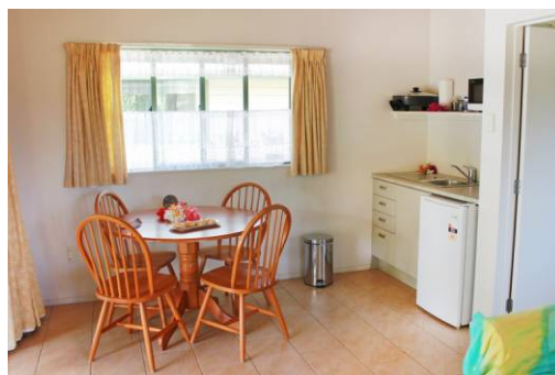
Dining & Kitchen Area