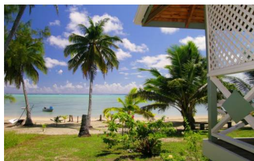
Lovely view to lagoon & beach