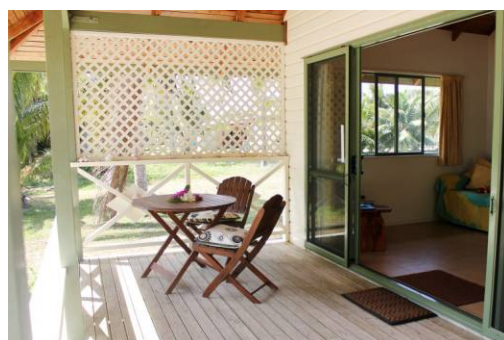
Private Balcony with Chairs for Relaxing