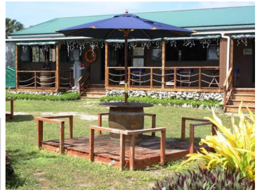
THE BOAT SHED