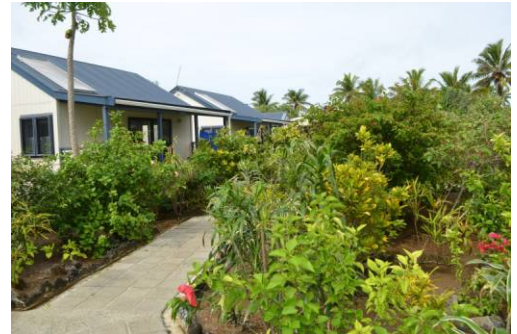
WALKWAY TO THE PRIVATE VILLAS

Popoara Ocean Villas offer a neat and tidy accommodation option to suit the budget conscious traveller and is a sanctuary for tranquillity and comfort with minimal fuss and a tropical paradise, all at an affordable price.