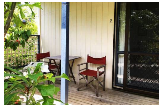
SELF-CONTAINED VILLA EXTERIOR