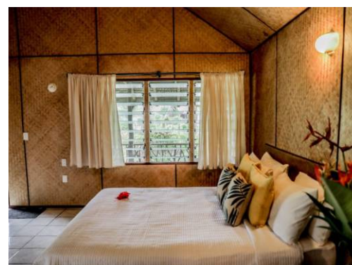
GARDEN VIEW VILLA