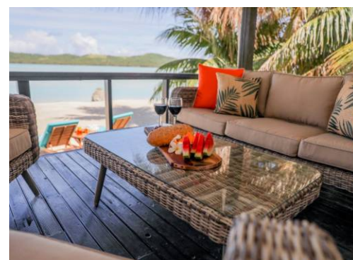
BEACH VIEW VILLA