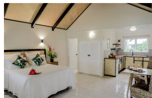
ABSOLUTE BEACHFRONT VILLA