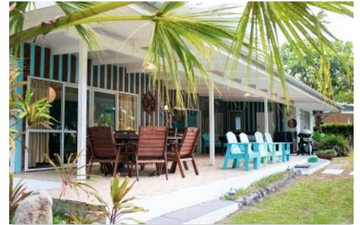
Anchors Rest awaits...

Anchors Rest Holiday Home offers great value for money accommodation coupled with its excellent private beachfront location.