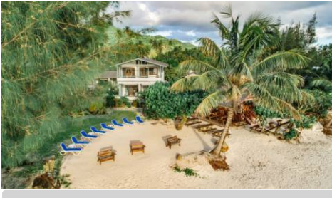
AROA BEACHSIDE RESORT

The Shipwreck Hut is an authentic beach bar situated onsite and is a great place to enjoy a light meal and a cold beverage on the beach. Enjoy an evening on the sand with live entertainment offered three times a week and superb sunset views.