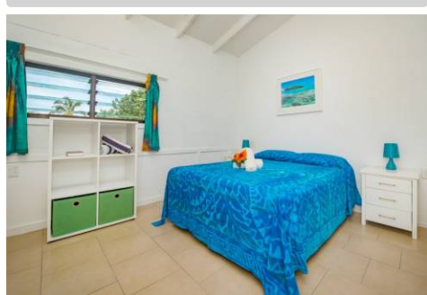
LAGOON SUITE 2 BEDROOM