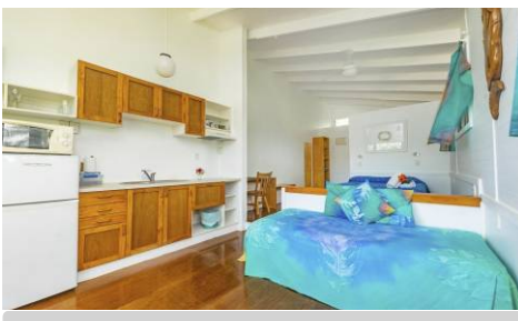
BEACHSIDE DELUXE UNIT