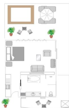
GARDEN & BEACHFRONT ARE