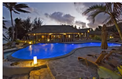
Indulge yourself with a cocktail by the resort pool

Formally opened in late 2014, Nautilus Resort is the premier choice for discerning travellers seeking serenity and tranquillity amid natural South Pacific beauty. Come and discover one of the world's most desired tropical destinations in exclusive style.