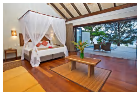
Luxurious California King Beds await you