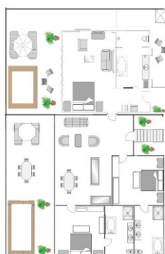
3 BEDROOM ARE