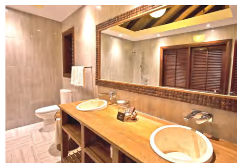
His & Hers Bathroom Vanities