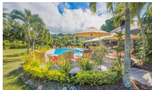
MURI BEACH RESORT

Please note that Muri Beach Resort have two price options to choose from; they have 'Premium Service Rates' which include complimentary daily full breakfast as well as housekeeping, and the 'Self Service Rates' which include complimentary welcome breakfast basket on your first day of arrival only.