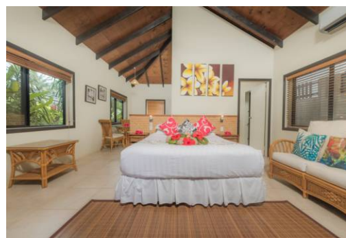
POLYNESIAN INSPIRED INTERIORS