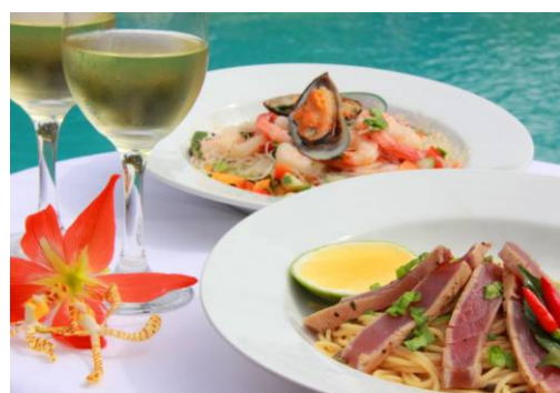
MOUTHWATERING SEAFOOD DISHES AT AQUA RESTAURANT