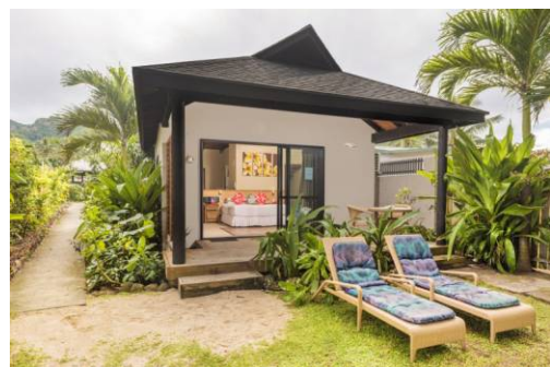
STYLISHLY APPOINTED VILLAS