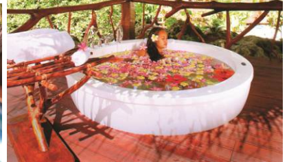
ROYAL HONEYMOON POOL VILLA (PRINCESS TE ARAU)