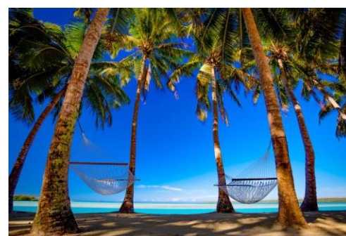
RELAX ON A HAMMOCK BY THE BEACH