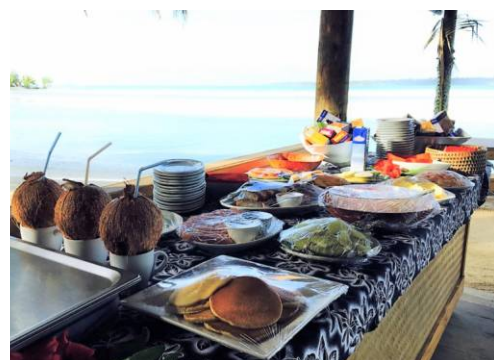
Continental Breakfast served at The Blue Lagoon Restaurant