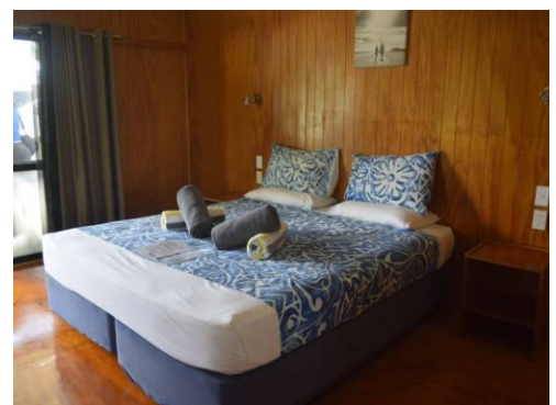
Holiday Beach Hut Interior