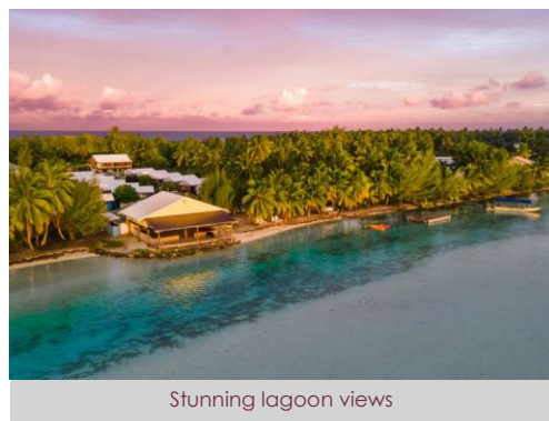
Stunning lagoon views