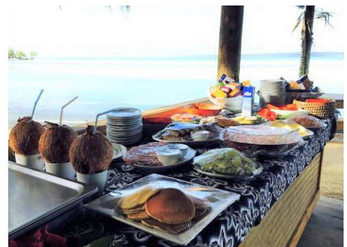
Continental Breakfast served at The Blue Lagoon Restaurant