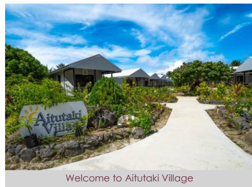
Welcome to Aitutaki Village

Daily Tropical Breakfast, Return Airport Transfers, and Free use of Kayaks, Sun Loungers and Beach Towels.