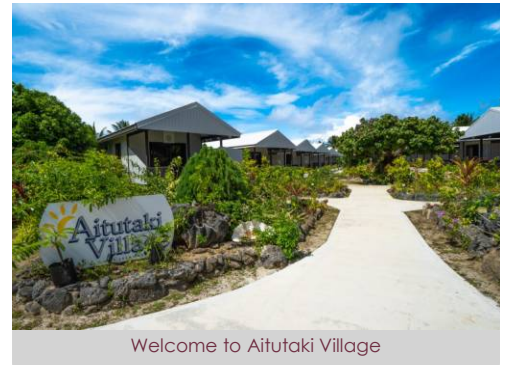
Welcome to Aitutaki Village

Aitutaki Village provides a combination of genuine local hospitality and modern comforts for to enjoy a comfortable and completely unforgettable holiday experience. It's a popular choice for not only families and business travelers, but also for couples looking to escape from their busy lives to just relax in warm tropical weather.