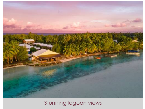
Stunning lagoon views