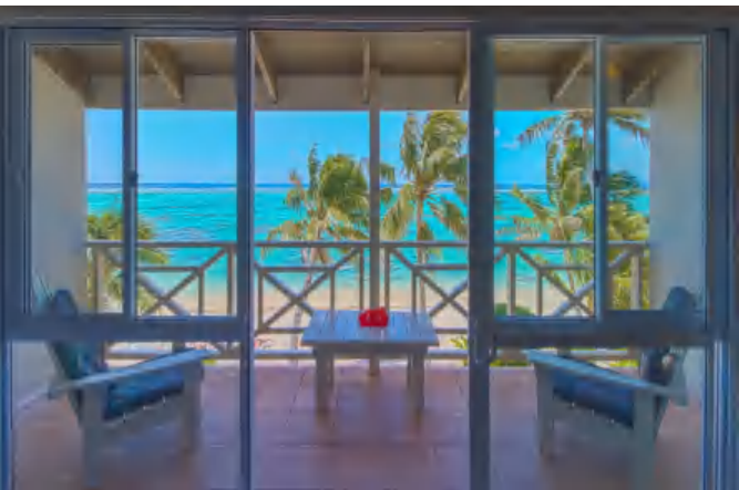
DELUXE BEACHFRONT STUDIO