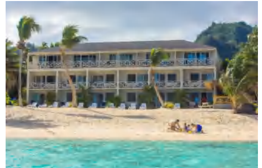
MOANA SANDS BEACHFRONT HOTEL

Moana Sands Hotel is a great choice for all travellers looking for great beachfront accommodation at a very reasonable price. Your time here will leave you feeling relaxed and rejuvenated, with fond memories of the Cooks Islands to take home with you.