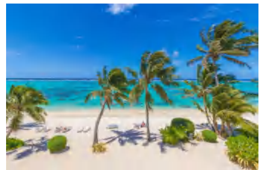
STUNNING BEACH & LAGOON