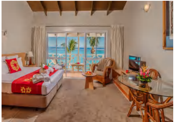
DELUXE BEACHFRONT STUDIO