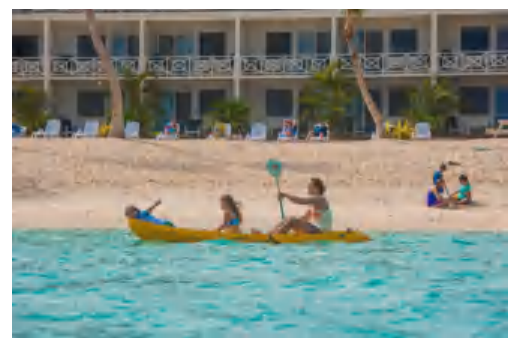
KAYAKS AVAILABLE FOR YOUR ENJOYMENT