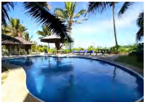
SWIMMING POOL & BBQ BEACH HUT