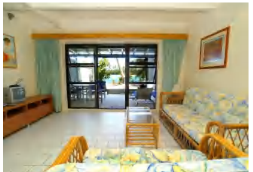
LOVELY LOUNGE AREA