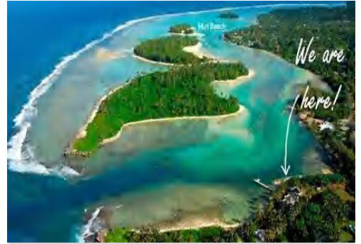
AVANA WATERFRONT BEACH LOCATION

A well appointed property in secluded location with stunning views.