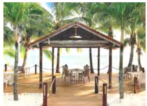
SHELTERED OUTDOOR DECK