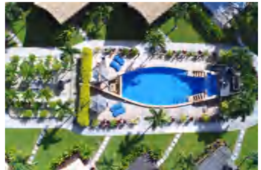
FRESH WATER SWIMMING POOL