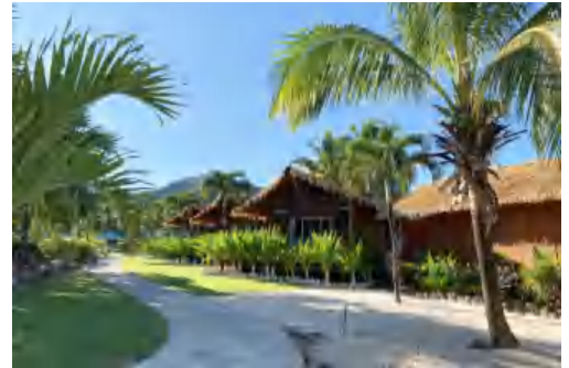
MAGIC REEF BUNGALOWS

Set back from the main road makes this stunning location a quiet and secluded property. Your time here in paradise will leave you feeling refreshed, relaxed and rejuvenated.