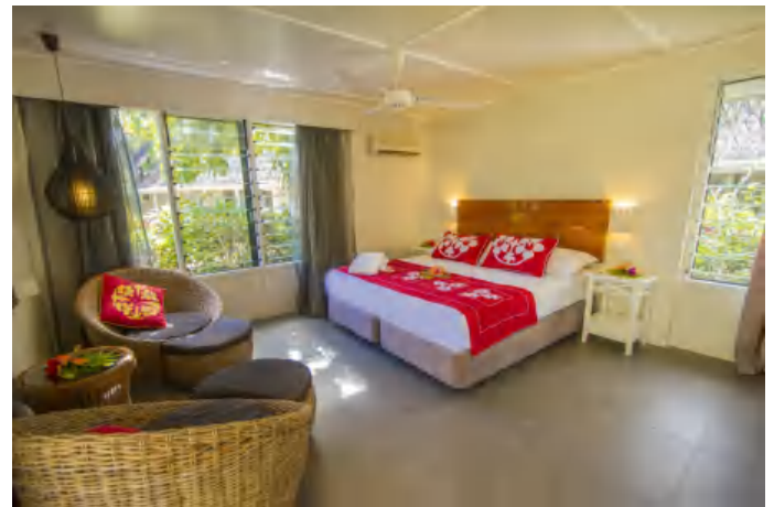
VIP GARDEN & BEACHFRONT SUITE