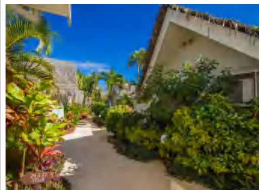
PREMIUM GARDEN SUITES

**Due to our Covid-19 precautions, we recommend guests bring their own snorkelling gear and face mask, or buy locally.