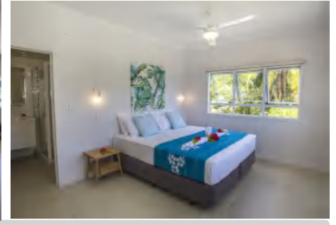
2 BEDROOM APARTMENT