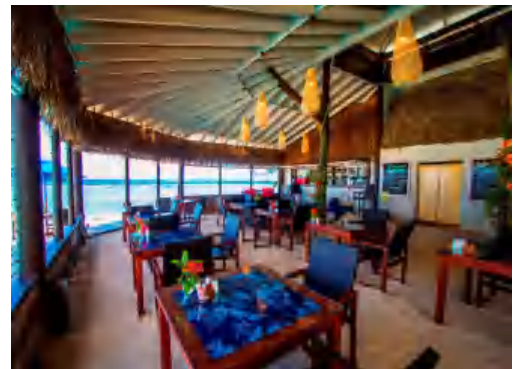
ON THE BEACH RESTAURANT & BAR