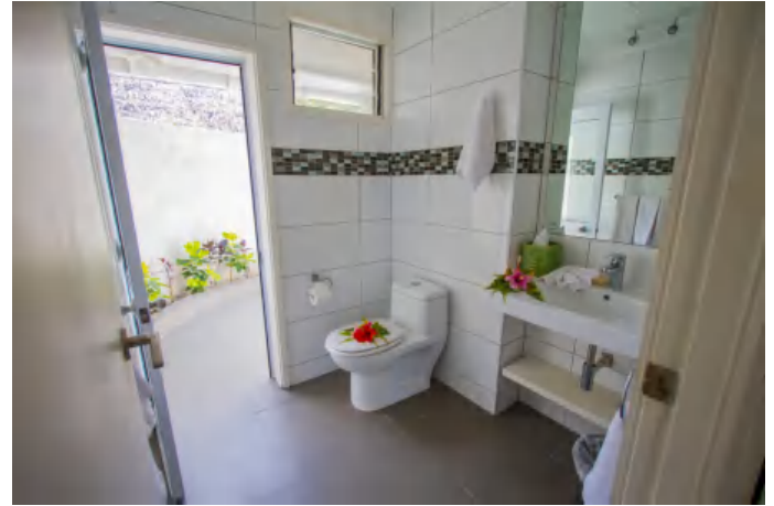
PREMIUM GARDEN SUITE