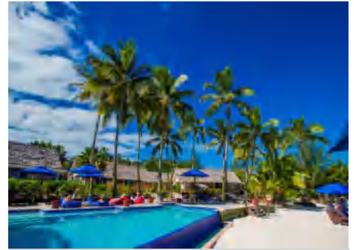
MANUIA BEACH RESORT

Manuia Beach Resort has a range of onsite facilities and operate a good selection of cultural activities and tours, including Scuba Dive Try-outs in Resort Pool, Round Raro Mystery Tour, Ukulele Lessons, Sunday Church Service and much more. It is a great option for anyone looking to escape from their busy lives and reconnect with their loved ones.