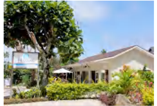
ENTRANCE TO MOANA SANDS VILLAS

Situated at the Villas is Hibiscus Spa, which offers a range of beauty treatments including a relaxing full body massage that will leave you feeling relaxed, refreshed and rejuvenated. The popular Coco Latte Café is adjacent to the property, with an outdoor dining area with covered picnic tables. The café has a great menu to take you from breakfast to lunch.