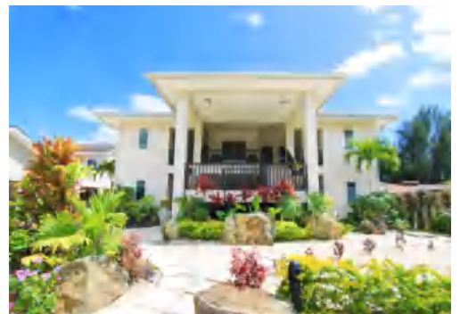
MOANA SANDS VILLAS