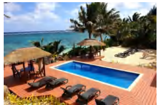
SWIMMING POOL & PICNIC AREA