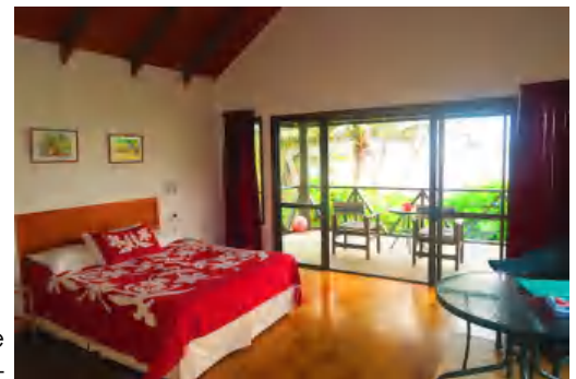
VIBRANT COLOR FEATURED IN THE ROOMS