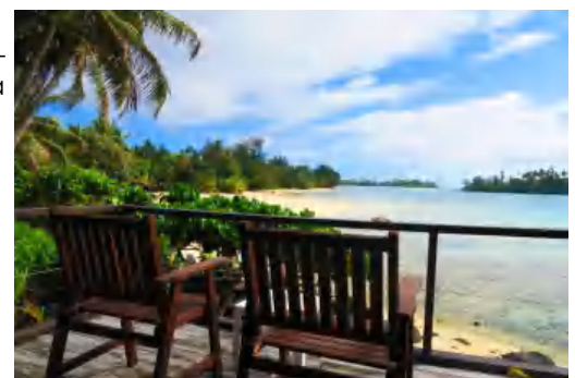
AMAZING LAGOON VIEW