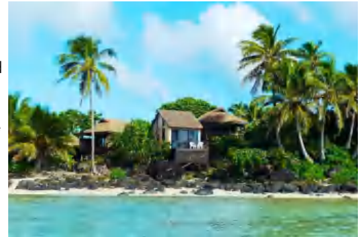
MURI BEACH COTTAGES

Muri Cottages is a perfect escape for those looking for a peaceful, child-free environment at a great value for money. This serene property is also a great holiday destination for the budget conscious traveler.