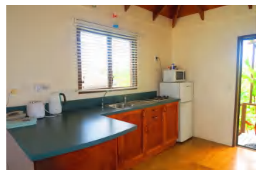
SIMPLE KITCHEN INTERIOR