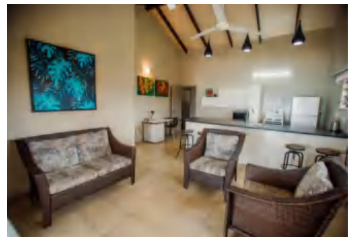
RONGOUNA VILLA LOUNGE AREA