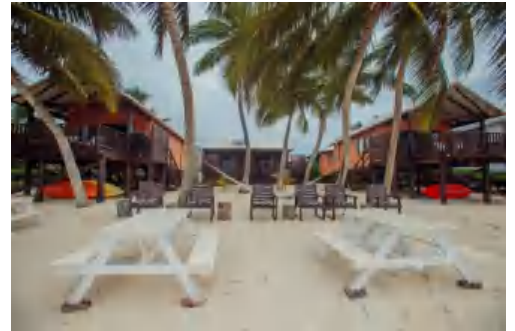
EXCELLENT BEACH FACILITIES