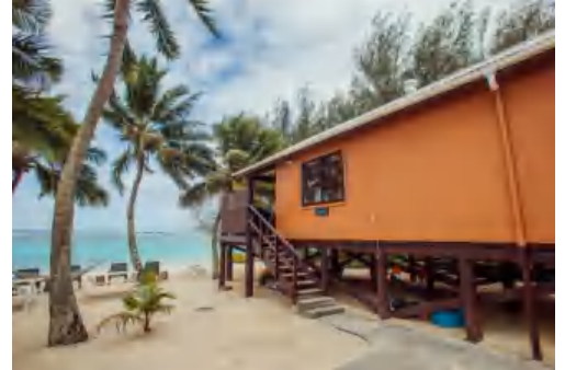
BEACHFRONT STUDIO VILLA

This property is perfect for families, couples and romantics or a small group of friends looking for a peaceful getaway, away from their busy lives and in an environment with maximum privacy.