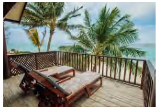
TOKO RIMA STUDIO OVERLOOKING THE LAGOON