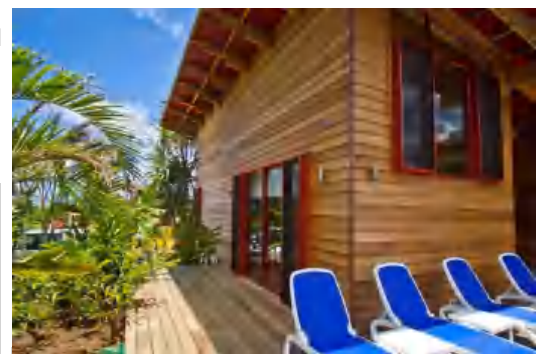
RELAX BY THE POOL & SOAK UP THE WARM HEAT