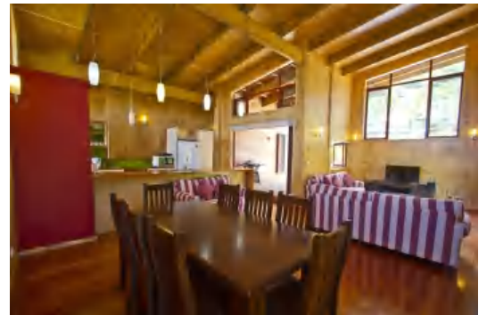
SPACIOUS LOUNGE AREA