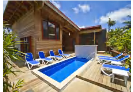
EXCELLENT OUTDOOR COMFORT

Paradise Holiday Homes is an intimate sanctuary for families, friends and romantics as they offer a generous amount of space, privacy and indulgence. These have been designed for travelers who appreciate nature's beautiful and fine surroundings, independence and luxuriously appointed self-contained destination.