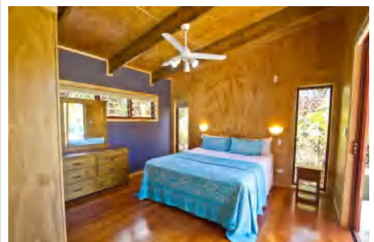
LARGE ROOMS WITH POLYNESIAN DESIGNS