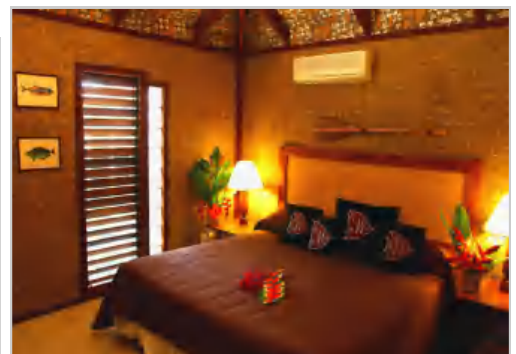
YOUR BEDROOM INTERIOR