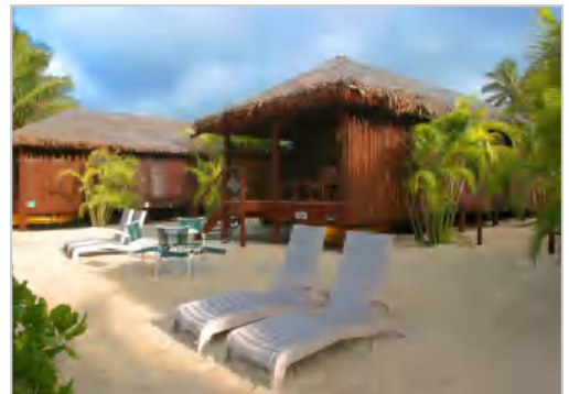
EXTERIOR VIEW OF YOUR BUNGALOW