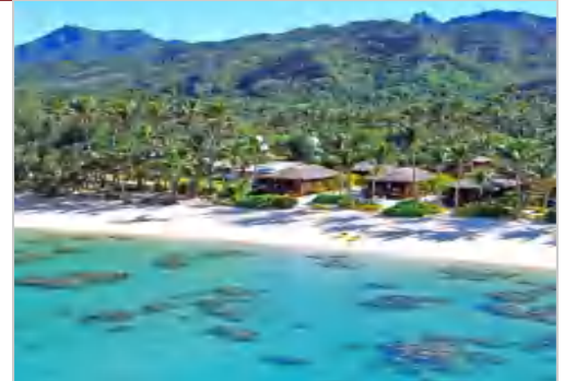
AERIAL BEACHFRONT VIEW OF THE PROPERTY

Onsite, you will find many beach luxuries, allowing you to relax and unwind in the summers heat. Snorkelling and kayaking gear are complimentary for guest use only so your days may be filled with thrilling sea adventures.