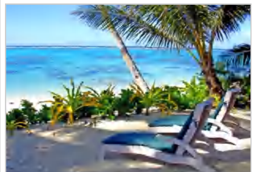
SIT BACK, RELAX AND ENJOY THE STUNNING VIEW