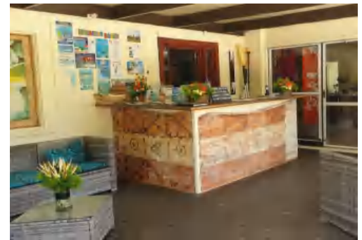
PARADISE COVE RECEPTION