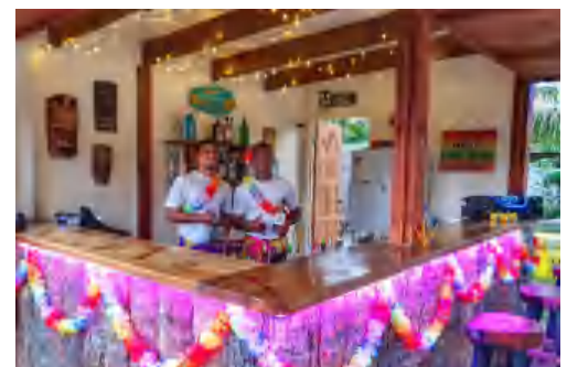
THE COVE BAR