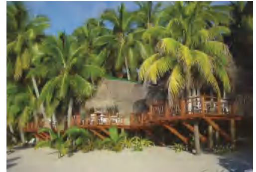
ELEVATED BEACHFRONT BUNGALOWS

The Breakfast Hut is situated near the entrance of the property and serves daily breakfast and lunch (charges apply) and an informal food sale which serves on selected days in the evenings only. The Cove Bar is an authentic garden bar located onsite and is a great place to unwind and enjoy a cold beverage on the beach. Enjoy an evening stroll or relax in the sand to catch some of the islands most breath-taking sunsets.