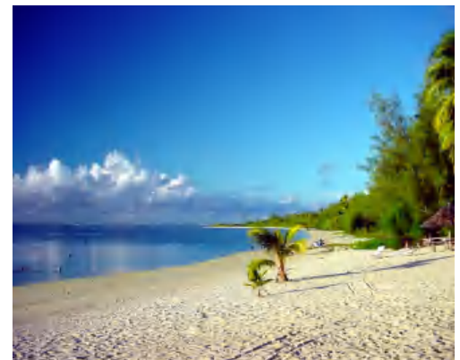
STUNNING LAGOON VIEW