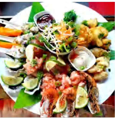
EXQUISITE MEALS SERVED AT THE ISLANDER RESTAURANT