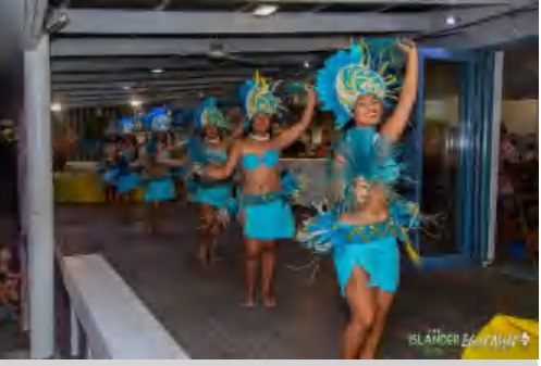
SPECTACULAR ISLAND NIGHT SHOW