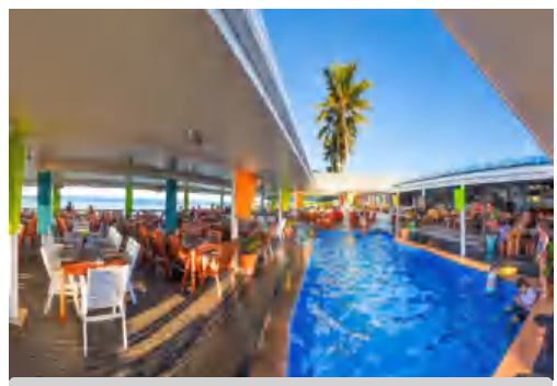
THE ISLANDER HOTEL

Daily Tropical Breakfast (cereals, yoghurt, fresh fruit, toast & spreads), Complimentary Airport Transfers for stays of 3 Nights or More and Complimentary shuttle services to Avarua town centre & Black rock beach