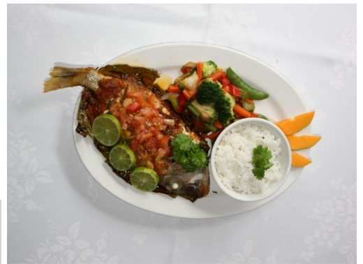
TROPICAL ISLAND MEALS AT THE BOAT SHED BAR & GRILL