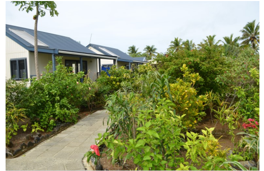
WALKWAY TO THE PRIVATE VILLAS

Popoara Ocean Villas offer a neat and tidy accommodation option to suit the budget conscious traveler and is a sanctuary for tranquillity and comfort with minimal fuss and a tropical paradise, all at an affordable price.