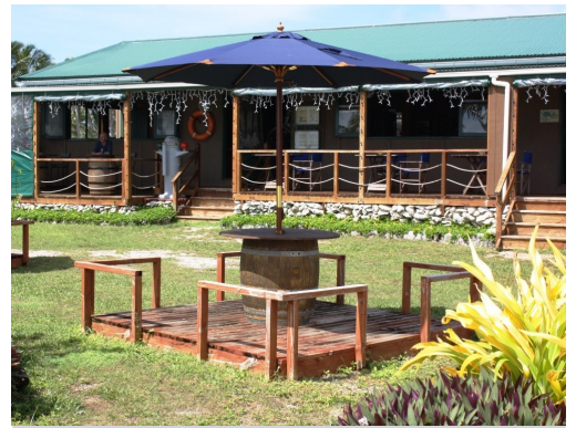
THE BOAT SHED