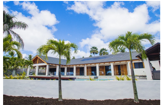
Red Sunset Villa

Red Sunset Villa is within easy distance of a stunning array of restaurants and cafes, takeaway outlets, a small grocery store, a rental car agency, a local dive center and an ATM.