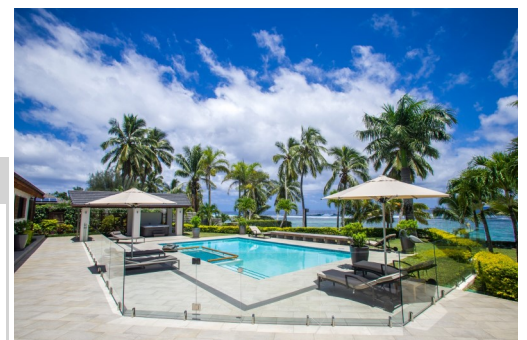
Breath-taking view of the swimming pool and beachfront