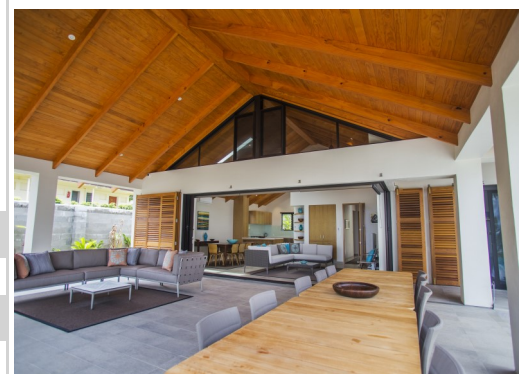
Outdoor living and dining space