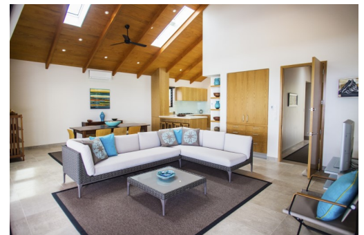
Kitchen and Lounge area