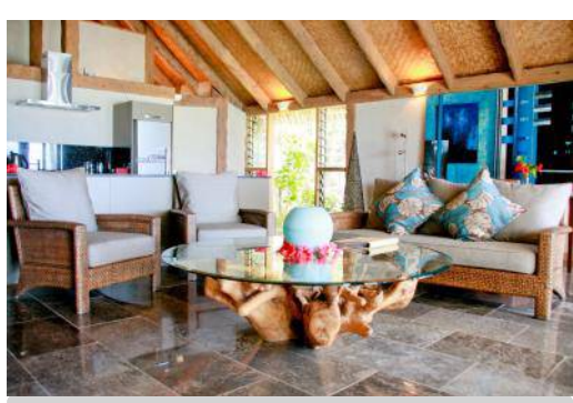
ONE BEDROOM LOUNGE AND KITCHEN