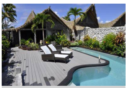
PRIVATE COURTYARD & SWIMMING POOL

Complimentary personal VIP return airport transfers with flower 'ei' greeting on arrival & full villa orientation, daily island breakfast delivered to your villa each morning & welcome fruit basket on arrival, complimentary Wi-Fi onsite, free use of kayaks, in-room telescope for star gazing, complimentary access to hard drive inhouse movie selection, and free supply ov UV filtered drinking water. Complimentary concierge services provided during regular Aitutaki business hours (8.00AM - 12.00PM).