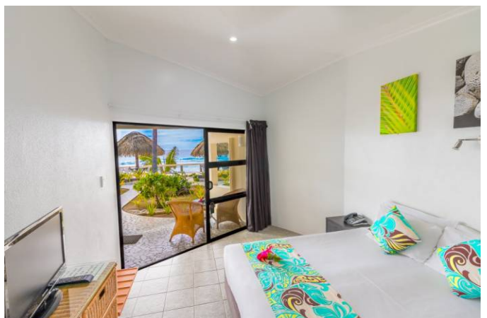
OCEAN VIEW ROOM