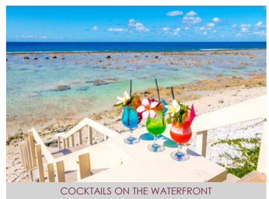
COCKTAILS ON THE WATERFRONT