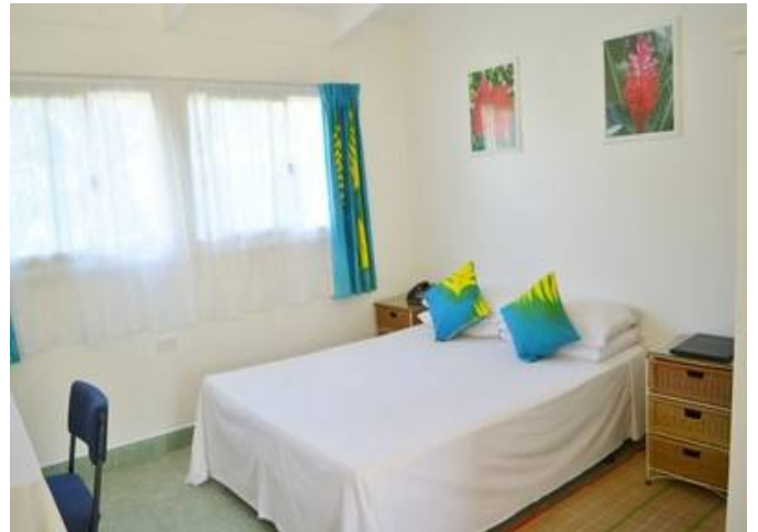
STANDARD SELF-CONTAINED ROOM