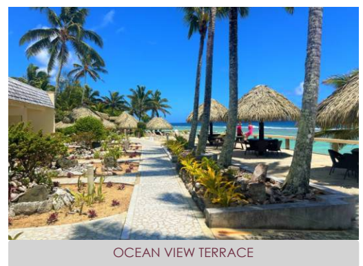
OCEAN VIEW TERRACE