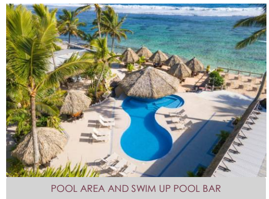
POOL AREA AND SWIM UP POOL BAR