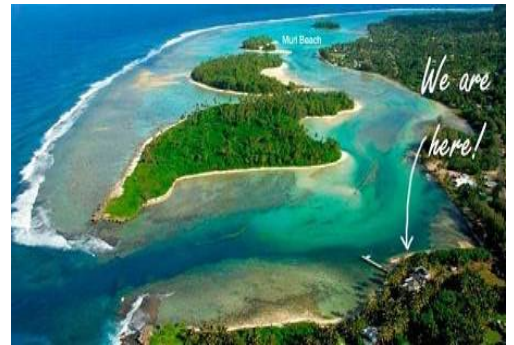
AVANA WATERFRONT BEACH LOCATION

A well appointed property in secluded location with stunning views.