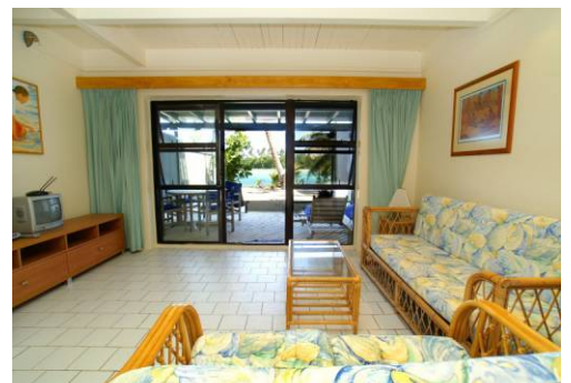
LOVELY LOUNGE AREA