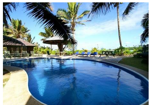
SWIMMING POOL & BBQ BEACH HUT