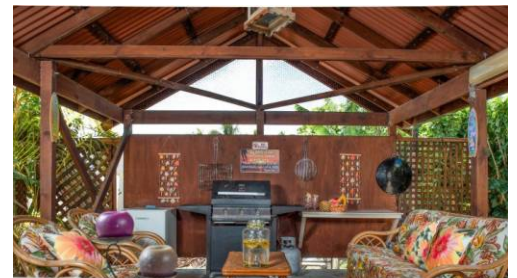
SHELTERED OUTDOOR BBQ AREA