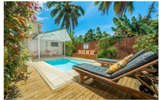
SWIMMING POOL & TROPICAL GARDEN SURROUNDING