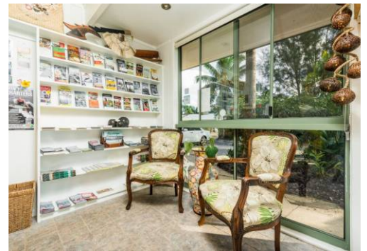
THE COOKS OASIS HOLIDAY VILLAS RECEPTION