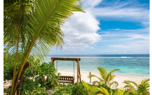
STRIKING BEACHFRONT VIEW

Onsite, you will find a stunning beach, a cool-off swimming pool, tour desk and complimentary snorkelling and kayaking gear. The Cooks Oasis also has easy access to many outside facilities including a small local bakery and a comprehensive range of casual and fine dining options.