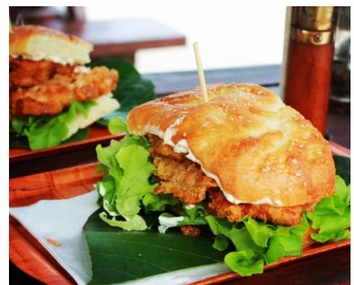
Delicious lunch to end your tour