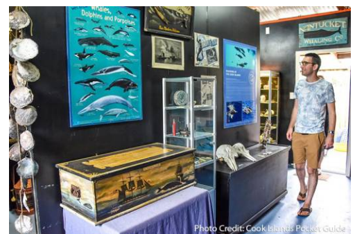
Discover Marine Wildlife and Eco Center