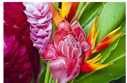
Maire Nui Tropical Gardens