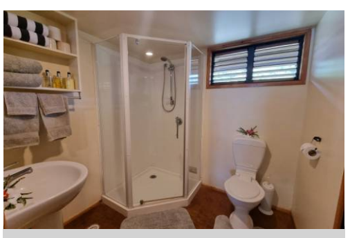
TOILET & SHOWER