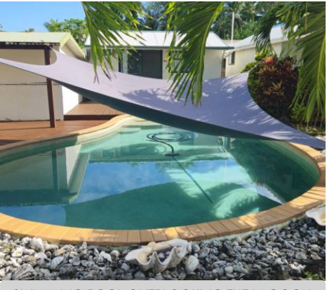
SWIMMING POOL OVERLOOKING THE LAGOON