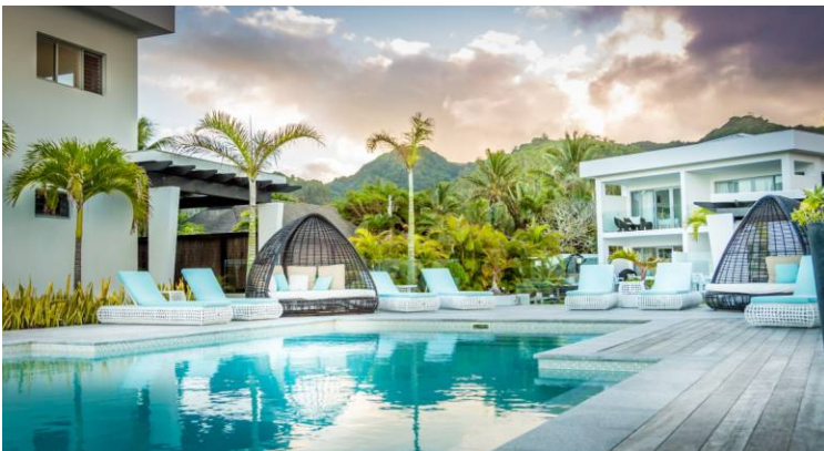
2 BEDROOM LAGOON VIEW VILLAS