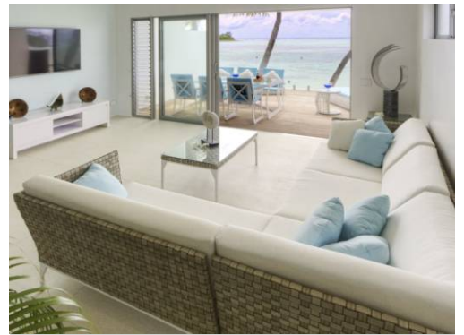
2 BEDROOM BEACHFRONT VILLA