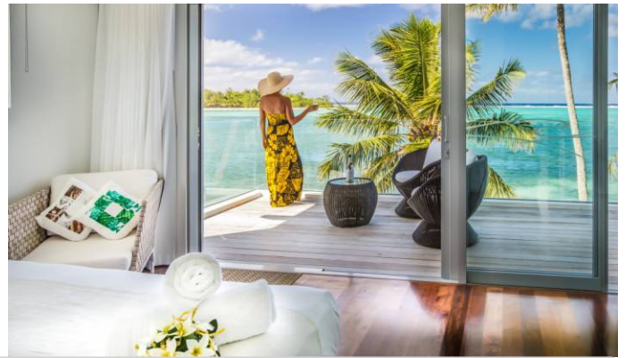
2 BEDROOM BEACHFRONT VILLAS