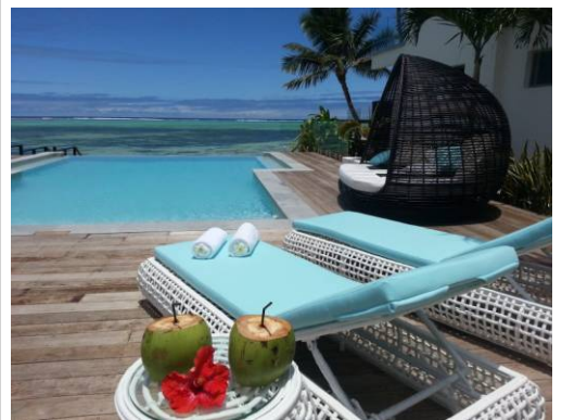
COCONUT DRINKS POOLSIDE