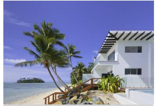
CRYSTAL BLUE LAGOON LUXURY VILLAS

Crystal Blue Luxury Lagoon Villas is the perfect choice for romantic couples looking to celebrate and rekindle their love for one another.