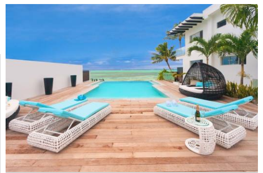
STUNNING VIEWS FROM THE INFINITY POOL AREA