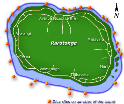
● Dive sites on all sides of the island

Night Dives are also available on request and include all the necessary equipment.