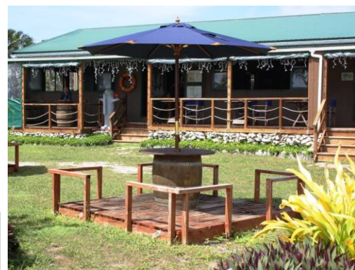
THE BOAT SHED