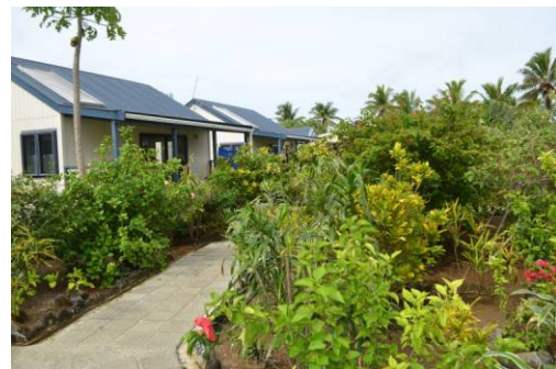
WALKWAY TO THE PRIVATE VILLAS

Popoara Ocean Villas offer a neat and tidy accommodation option to suit the budget conscious traveller and is a sanctuary for tranquillity and comfort with minimal fuss and a tropical paradise, all at an affordable price.