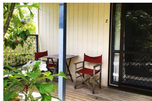
SELF-CONTAINED VILLA EXTERIOR