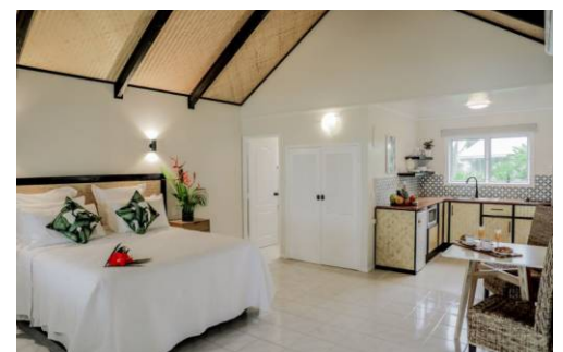
ABSOLUTE BEACHFRONT VILLA