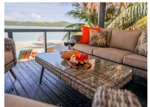
BEACH VIEW VILLA