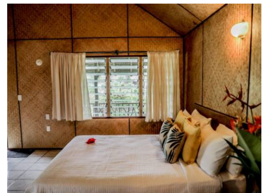
GARDEN VIEW VILLA