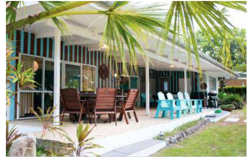
Anchors Rest awaits...

Anchors Rest Holiday Home offers great value for money accommodation coupled with its excellent private beachfront location.