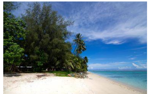
Prime beachfront location