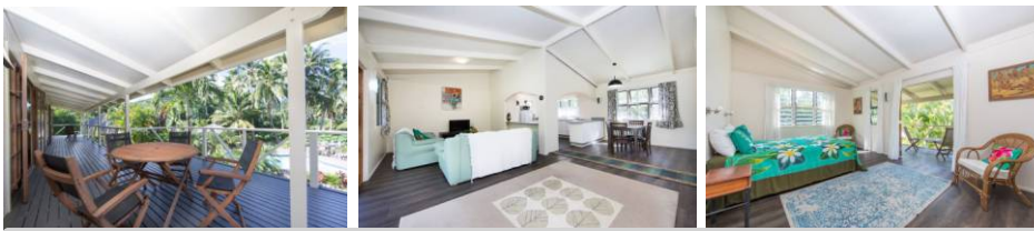
2 BEDROOM VILLA TA'I