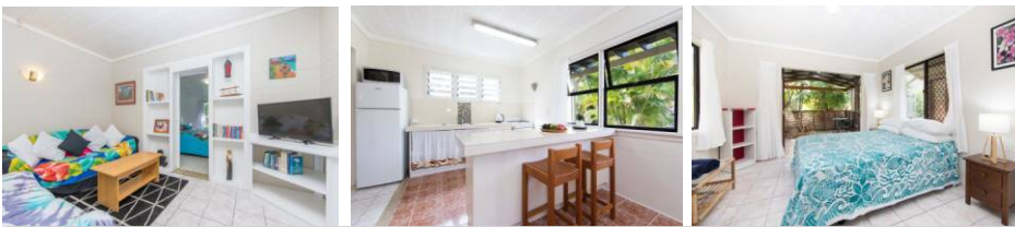
2 BEDROOM VILLA TA'I