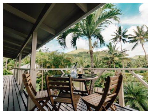
Villa Ta'i—view from balcony