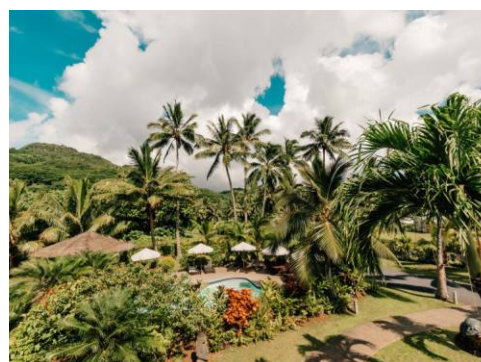
View to gardens & pool