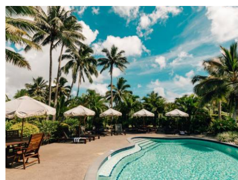
Arcadia guest swimming pool