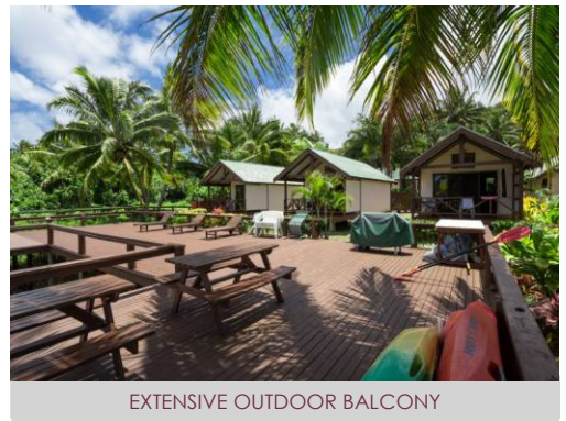
EXTENSIVE OUTDOOR BALCONY