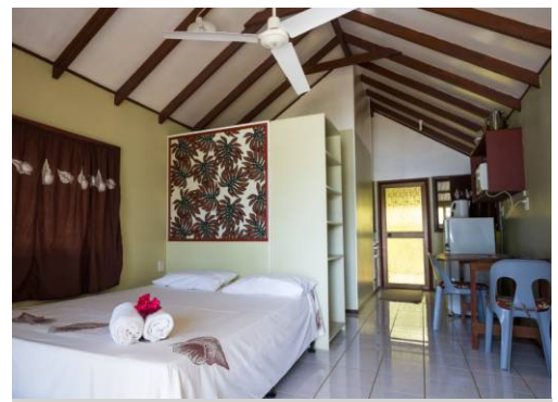
LOVELY BUNGALOW INTERIOR