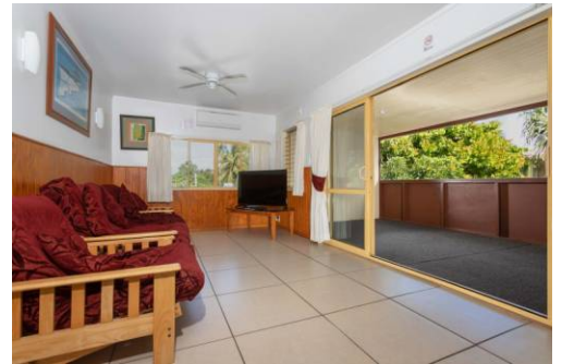
2 Bedroom Deluxe Suite - Lounge