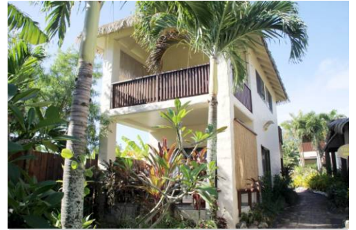
Your Villa awaits you...

The property is centrally located in the village of Arorangi. Restaurants, grocery stores and small retail outlets are all within walking distance of the property.