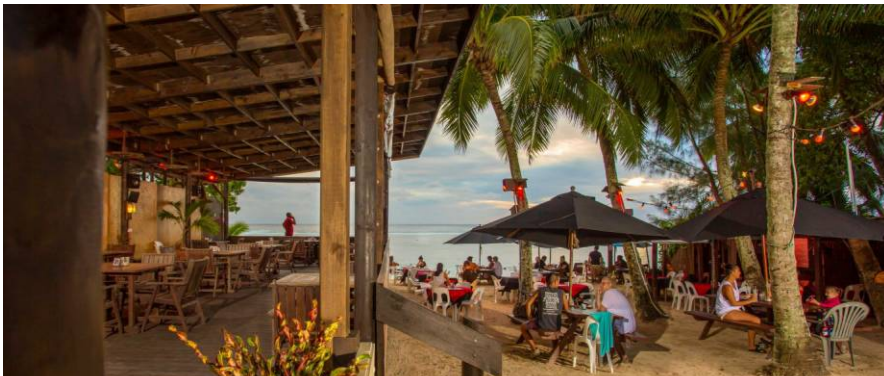
Ultimate Beachfront & Sunset Views