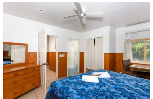
Beautiful island style beddings