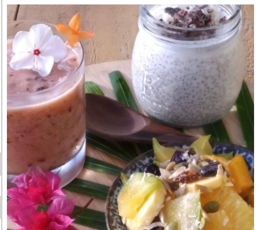
ORGANIC DAILY BREAKFAST