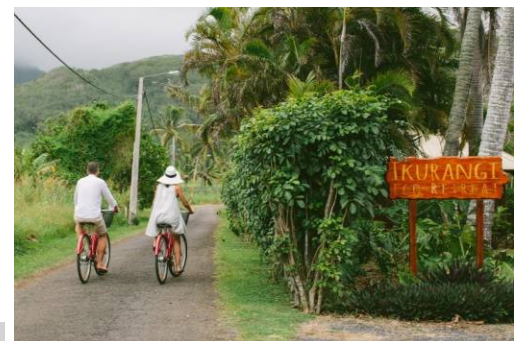
EXPLORE AT YOUR LEISURE