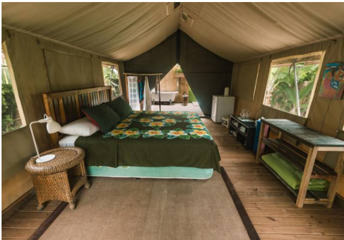
ARIKI SAFARI TENT