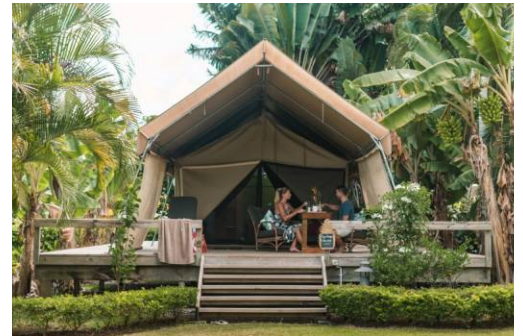
IKURANGI ECO RETREAT

Ikurangi Eco Retreat is no doubt a place where you can relax, reflect and appreciate the natural beauty of Rarotonga in style and comfort, whilst doing your part in caring for and protecting the environment.