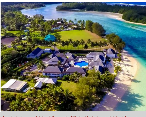
Aerial view of Muri Beach Club Hotel and Muri Lagoon

Muri Beach Club Hotel is within walking distance to a number of cafes, grocery stores, restaurants, salons and other resorts.