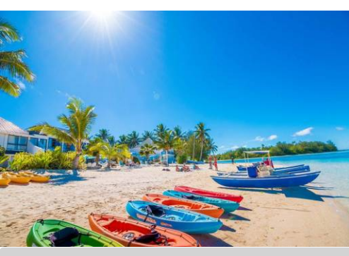
Water activities are available for your enjoyment