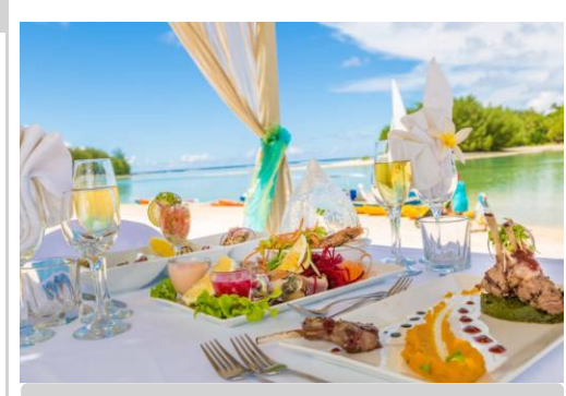
Just a little of what Silver Sands restaurant has to offer

Deluxe Beachfront Rooms also include use of bathrobes & guest slippers.