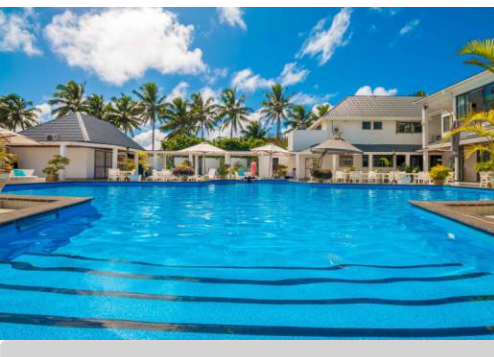
Great place to cool down, enjoy a meal or cocktail