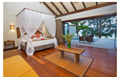
Luxurious California King Beds await you