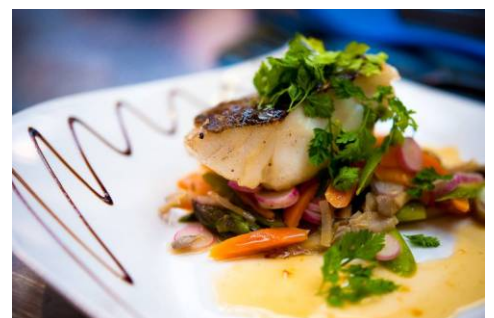
Just a taste of what Nautilus Restaurant has to offer