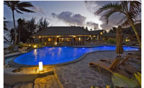
Indulge yourself with a cocktail by the resort pool

Formally opened in late 2014, Nautilus Resort is the premier choice for discerning travellers seeking serenity and tranquillity amid natural South Pacific beauty. Come and discover one of the world's most desired tropical destinations in exclusive style.