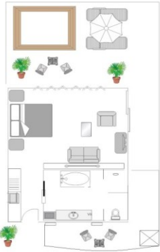
GARDEN & BEACHFRONT ARE