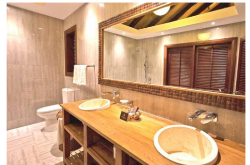
His & Hers Bathroom Vanities