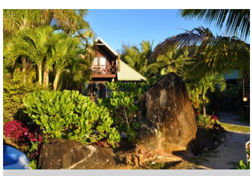
Sokala Villas awaits

This is an ideal property for those looking for a tranquil and quiet setting on the edge of beautiful Muri lagoon.