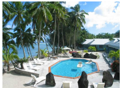
SUNHAVEN BEACH BUNGALOWS

Situated away from the busy island traffic and directly on the beach, Sunhaven Beach Bungalows makes for a peaceful, relaxing tropical holiday with easy access to outside conveniences.