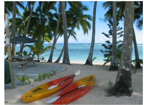
KAYAKS ON THE BEACH